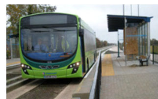
A Stagecoach bus in training on the record-breaking busway.