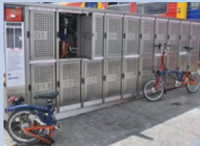
The new Brompton Bicycle dock at Guildford Station.