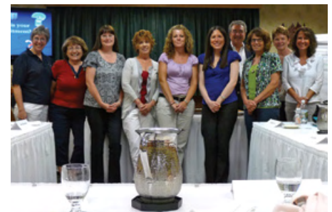
Coach USA staff at their 'ideas retreat'.

Colleagues met to exchange ideas and explore new internet and promotional initiatives to increase sales and promote tour packages to new markets, and the event was hailed a great success.