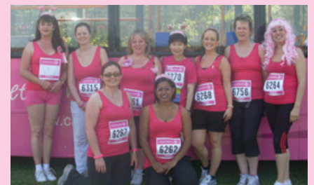
Cambridge Race for Life runners with the specially branded bus.