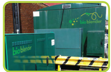
Kilmarnock depot's bio-blender allows 100 buses to run on greener fuel.