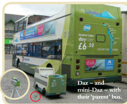
Daz – and mini-Daz – with their 'parent' bus.

To exercise their option to buy their Stagecoach Group plc shares at £2.51775 per share and receive a cash amount by immediately selling them. To take advantage of a reduced dealing cost of £15, staff must return their Maturity Instruction Form, as well as the Stocktrade Sale Request Form, to Yorkshire Building Society by 5 October 2011 .