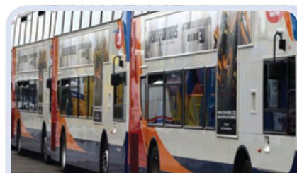
Stagecoach vehicles ready to take spectators to Silverstone.

"We believe that our luxury buses, with free wi-fi internet access, will encourage more people out of their cars and on to the route. I am pleased to see so many people trying out the new system, which provides a quick and smooth journey."