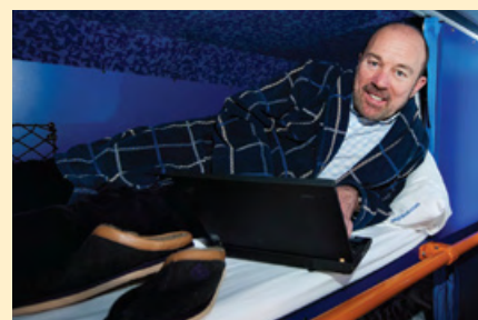
Sir Brian stretches out in the new megabus.com sleeper coach.

Stagecoach Group Chief Executive, Sir Brian Souter, said: "Travelling overnight is a great way to save time, and we've already seen