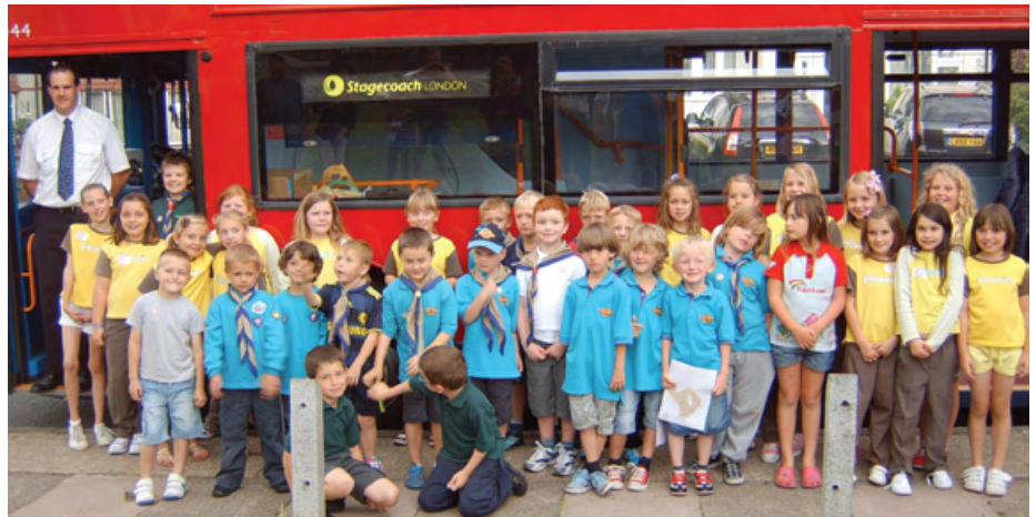
The youngsters with a Stagecoach London bus.