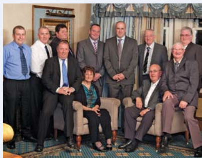
▶ LONG-SERVING Stagecoach Highlands staff (pictured above) recently enjoyed a special dinner in recognition of their loyal service.