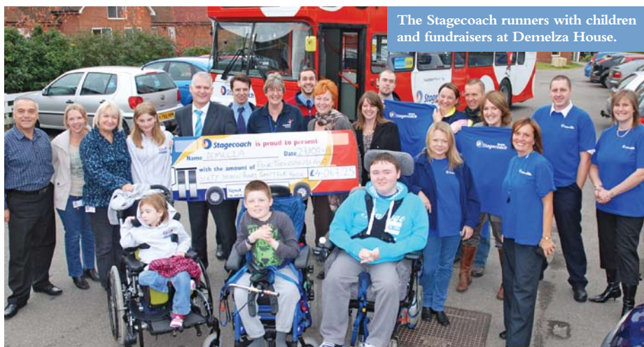
The Stagecoach runners with children and fundraisers at Demelza House.

■ To nominate someone, simply complete an application form available from lindsay.reid@stagecoachgroup.com or, for more information, visit www.givethemasportingchance.com