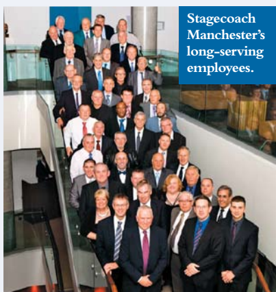
Stagecoach Manchester's long-serving employees.