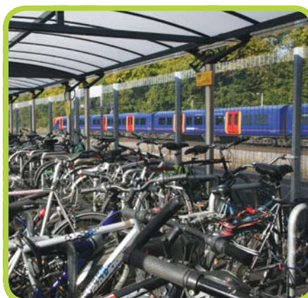
Cycle facilities at Farnborough Station helped South West Trains win a National Cycle Rail Award.

➤ SOUTH West Trains rode off with no less than three honours at the National Cycle Rail Awards.