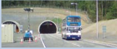
Underground, overground: A Stagecoach South Volvo Olympian emerges from the record-breaking tunnel.