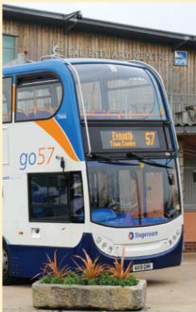
Wildlife treasures are being showcased on Stagecoach South West buses.

➤ WILDLIFE branding on eight new Stagecoach South West buses is encouraging passengers to embrace the great outdoors.