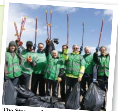
The Stagecoach East Scotland Green Team taking part in a clean-up of Fife's Leven beach.