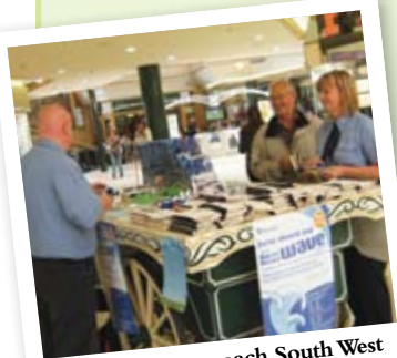
Staff from Stagecoach South West hand out goodies from their stall at Green Lanes shopping centre in North Devon.