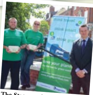
The Stagecoach East Kent & East Sussex Green Team hand out goodies in Ashford.