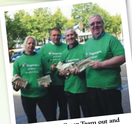
The Merseyside Green Team out and about in Liverpool.