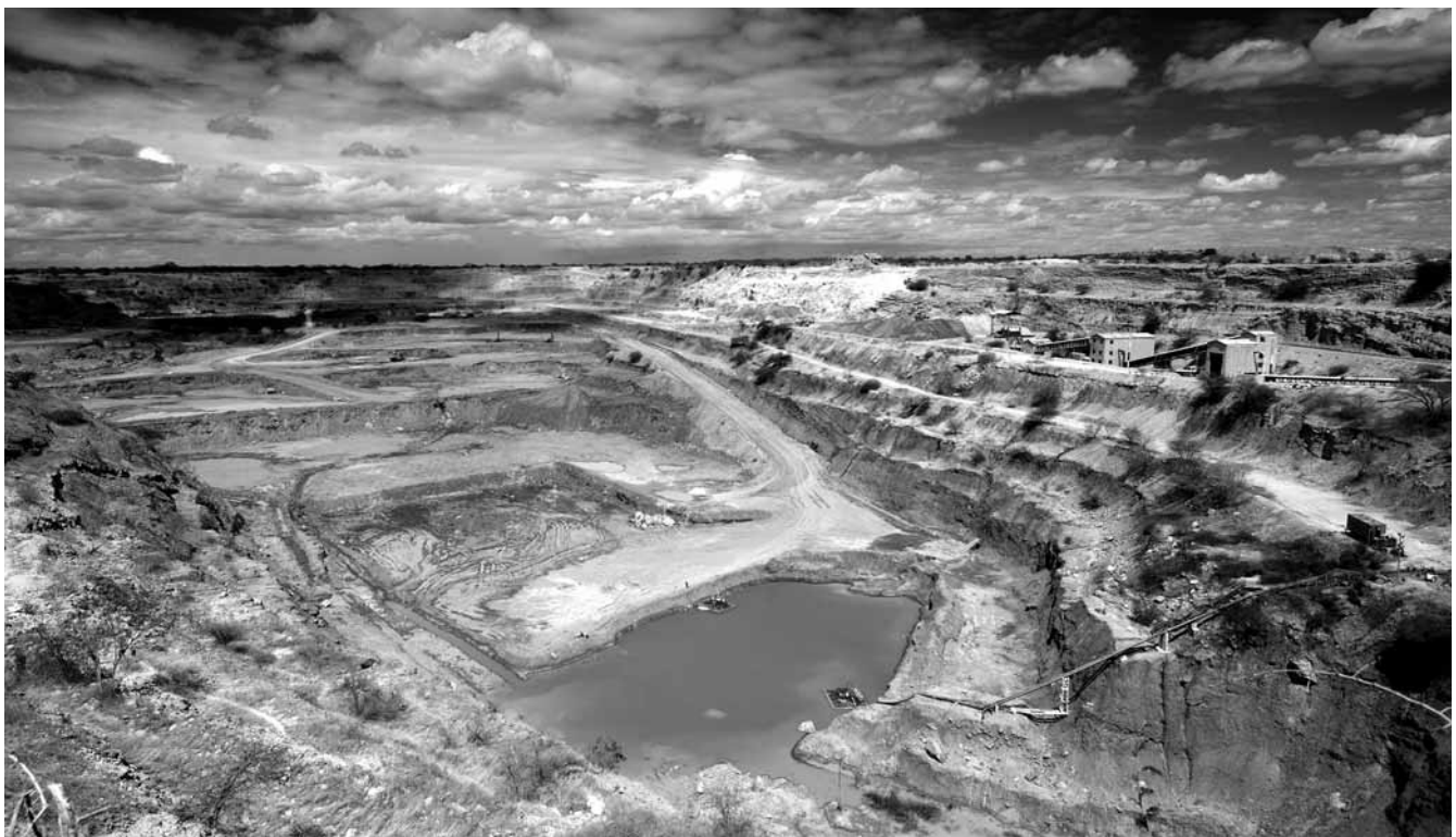
Williamson mine, Tanzania