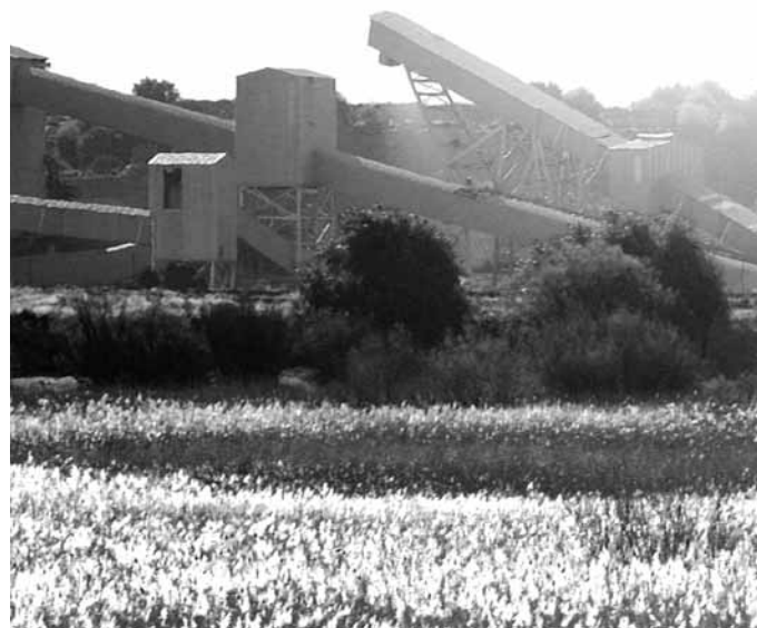
Koffiefontein mine, South Africa