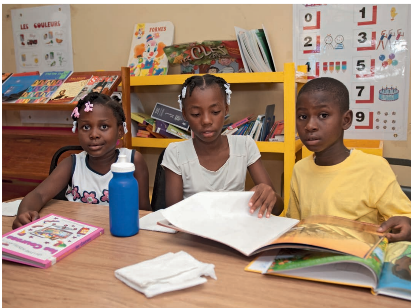
A classroom in the centre supported by Save the Children in Martissant (Port-au-Prince). Getting comfortable with reading: the bookshop built by Save the Children in Maissade.