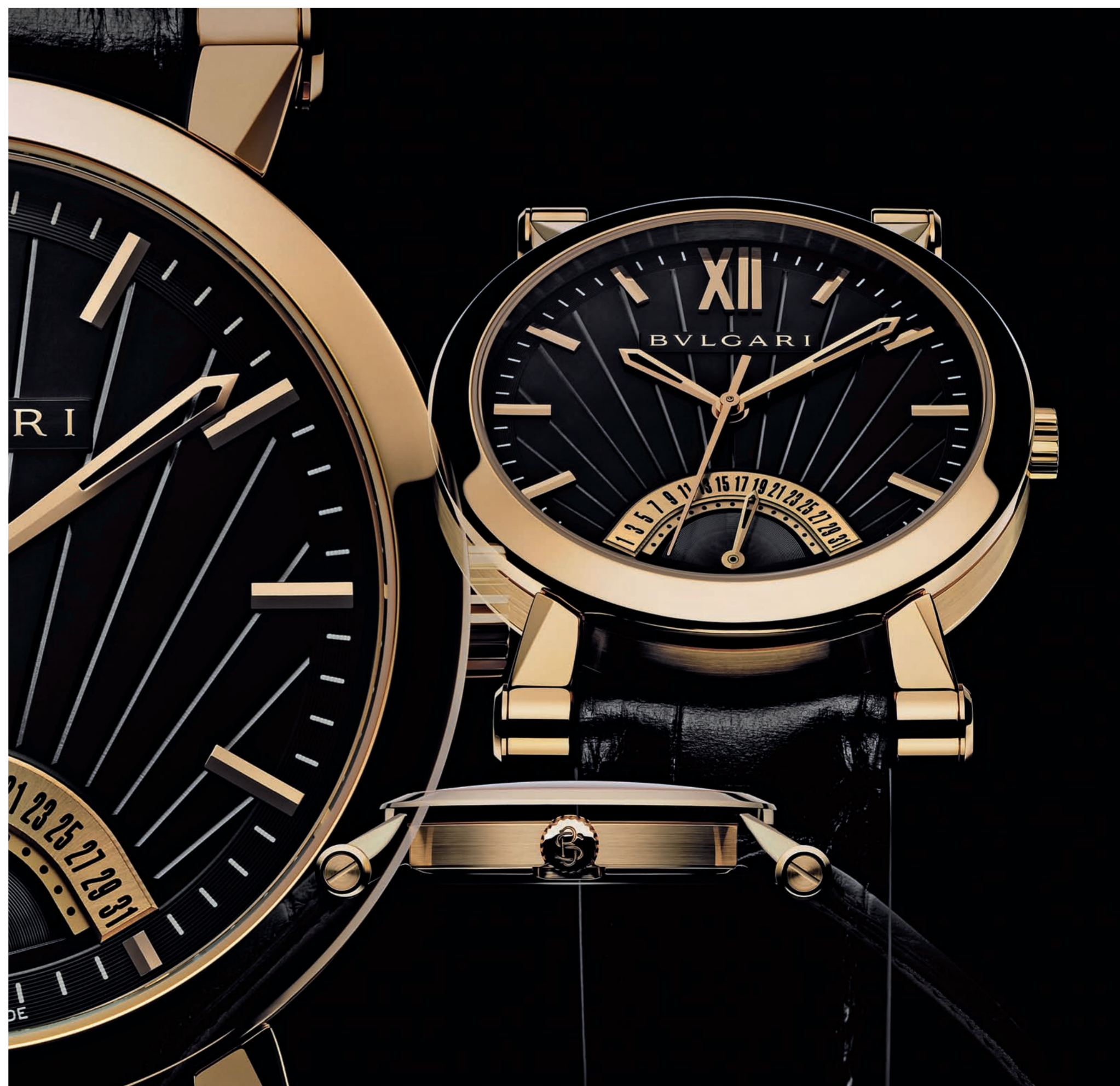
The Sotirio Bulgari in pink gold, with self-winding mechanical movement and retrograde date, module developed and produced by Bulgari.

The traditional values of Swiss watchmaking are apparent in the perfection of the exposed watch works, which can be admired through the sapphire crystal caseback. In the «125°» commemorative editions (in pink, yellow or white gold, featuring the caliber BVL250 manufacture movement, in limited editions of 125 pieces for each version), the back can be opened by a little hinged door – or rather, a window onto this amazing evolution of world-class watchmaking.