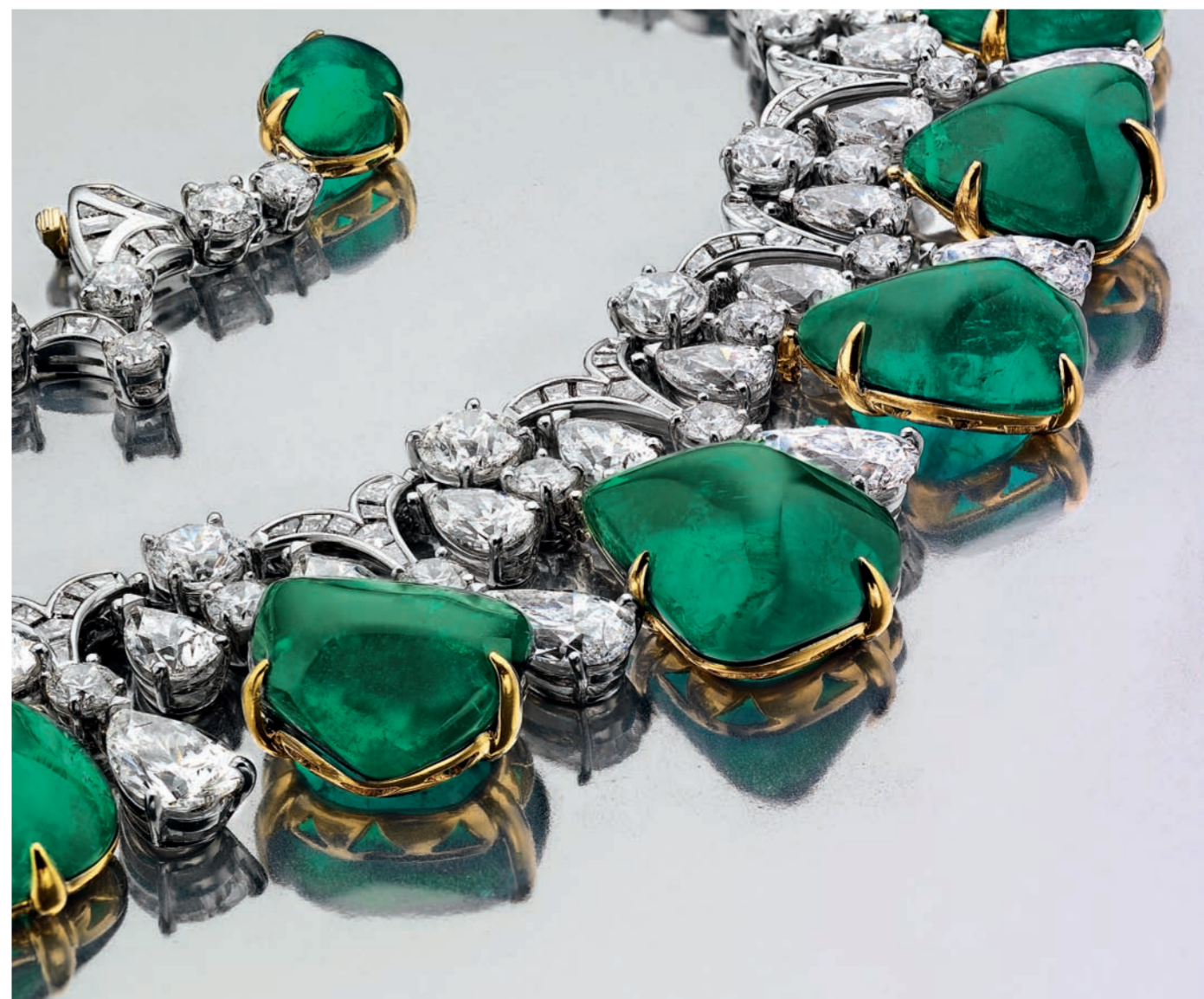
Detail of a necklace with rare emeralds and diamonds.