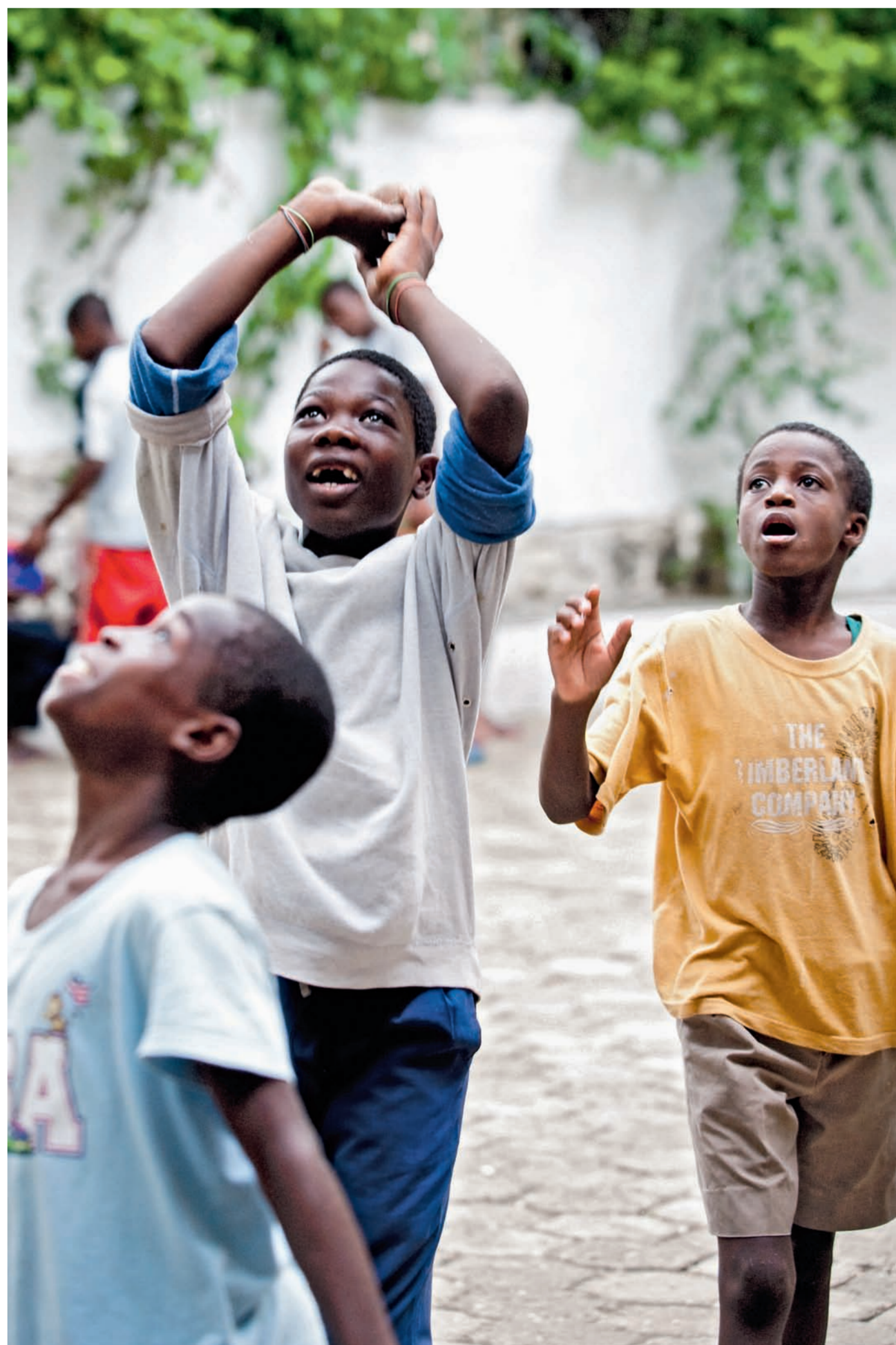
Petionville (Port-au-Prince): a basketball game at the Timkatek centre for homeless children.