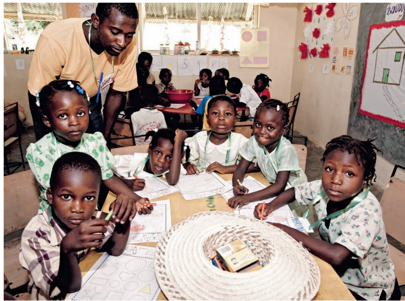
Preschool children from Maissade, a rural community in the mountains of central Haiti.

To name just a few: Willem Dafoe, Rosario Fiorello, Jason Lewis, Valeria Golino, Isabella Rossellini and Terence Howard. The future of the world thanks them all.