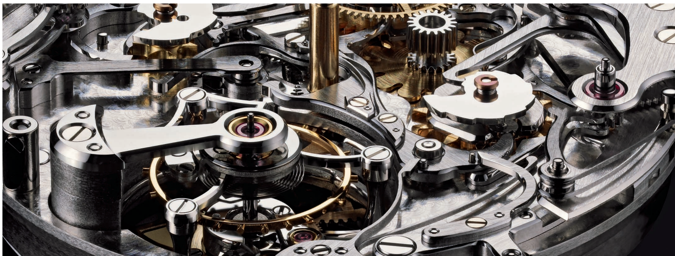
The BVL465 movement, manufactured by Bulgari. A multi-complication that incorporates several functions in interesting ways: transversal tourbillon and perpetual calendar with innovative display, with double coaxial retrograde hands.

The caliber BVL250 is a self-winding manufacture movement, personalised for Bulgari. The forms of the bridges and the rotor of this mechanism were redesigned to highlight the creativity of the design while at the same time exposing as much of the movement and its refined finishes as possible. The plate and bridges are adorned with two different "perlage" finishes – an unusual biaxial "côtes de Genève" pattern and a traits tirés treatment. All the corners are "diamantés", as is the sink for the rubies. The 18-kt gold rotor has a "satiné circulaire" finishing, while the central winding mechanism is "colimaçonée". The mastery of the Swiss "finisseurs" is witnessed by the attention to the decoration of every last component: even the heads of the smallest screws are polished, one by one.