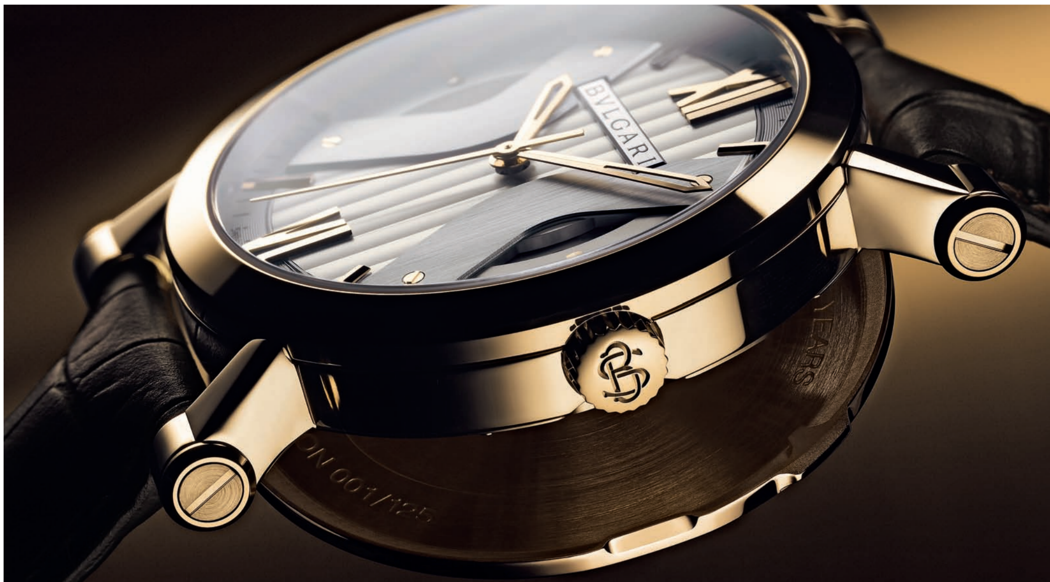
The Sotirio Bulgari «125°» commemorative edition, with yellow gold case. The movement is visible beneath the caseback in sapphire crystal.