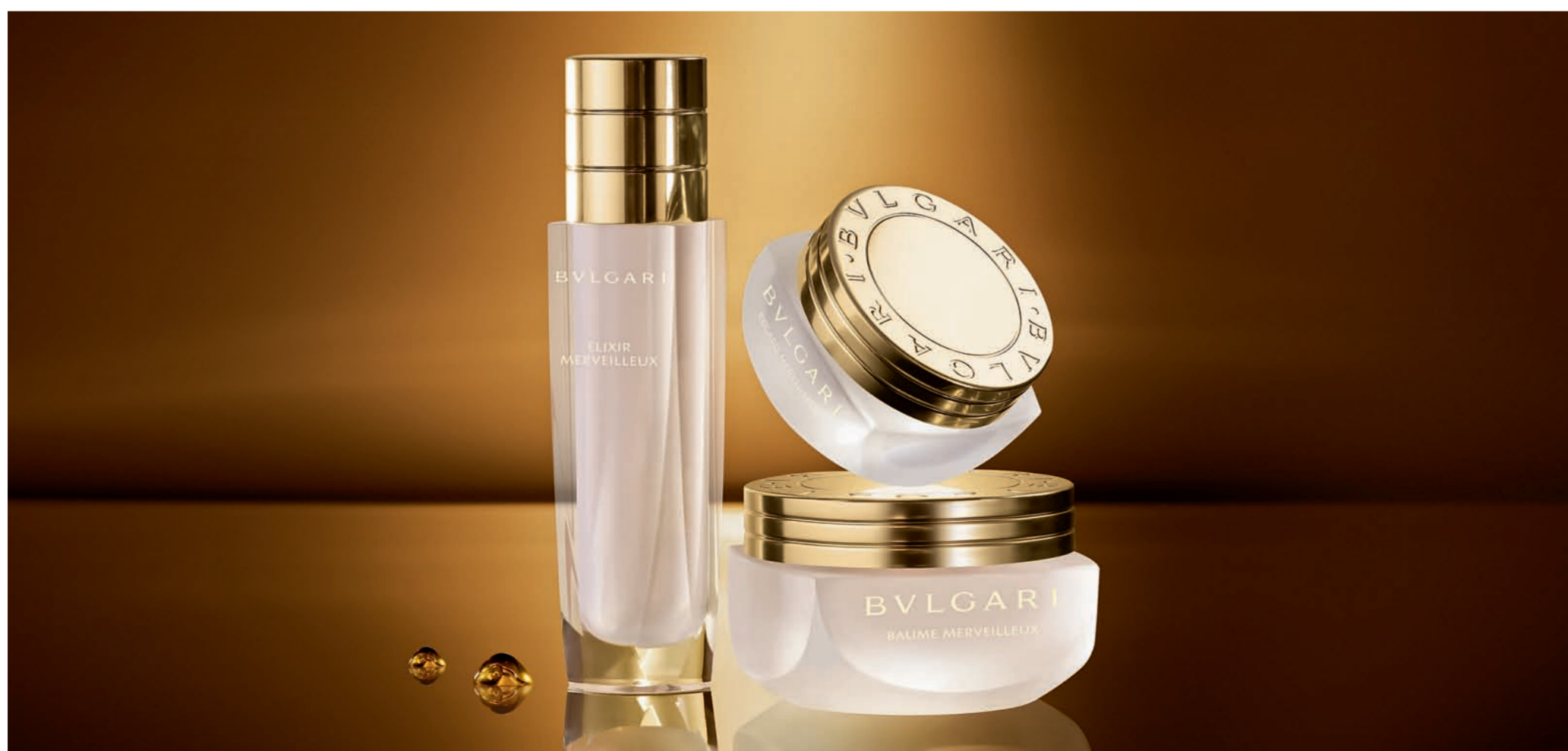
Elixir Merveilleux: Intensive Nutritive Serum - Redefining Sculptor Effect. Baume Merveilleux: Firming and Restoring Nourishing Cream for the face. Regard Merveilleux: Nutritive Restructuring Eye Contour Cream