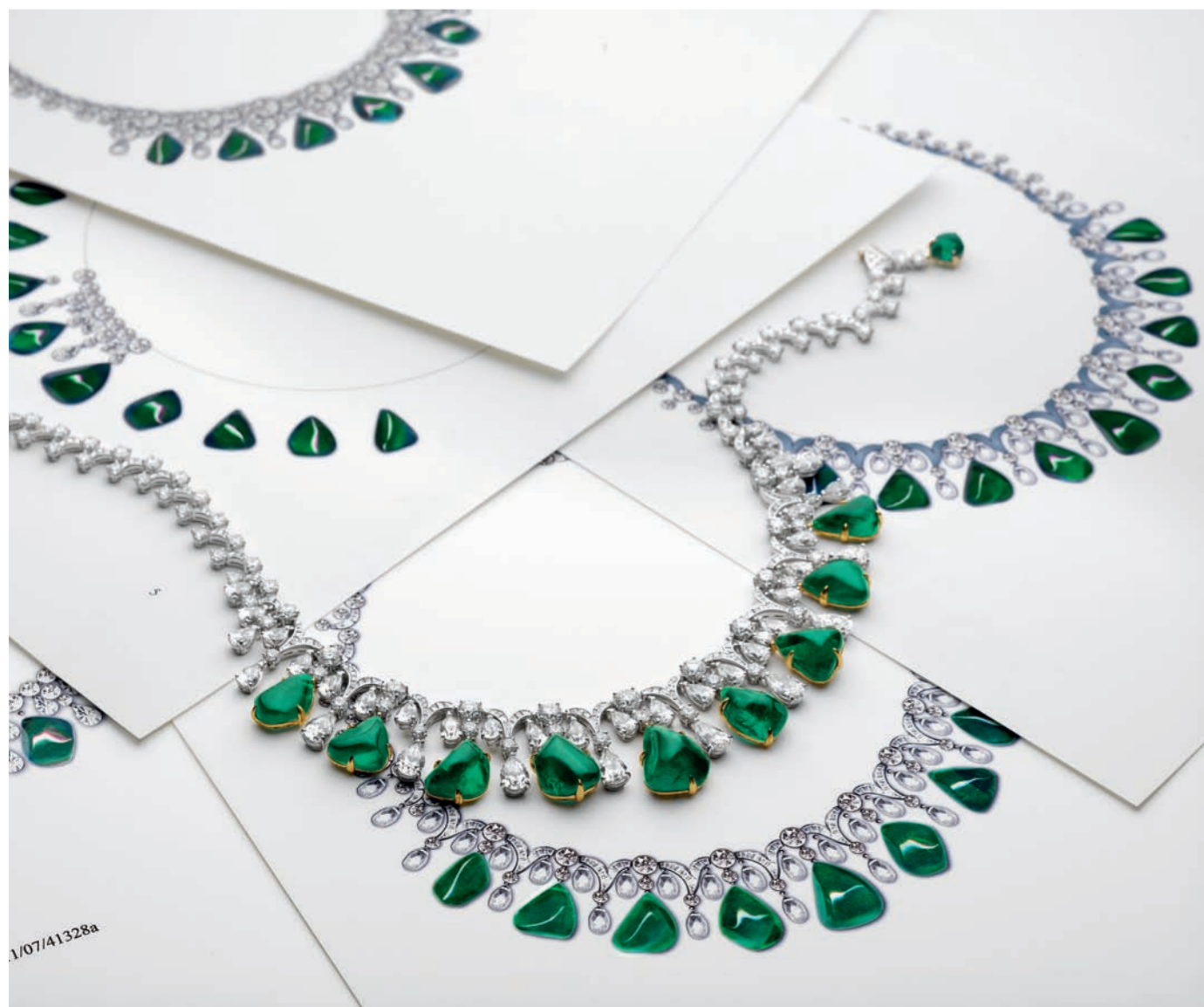
Emeralds of rare quality set into a necklace.